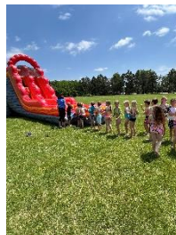
Bounce House Fun