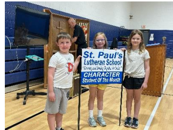
Character Education Winners