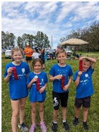
Field Day Relay Team