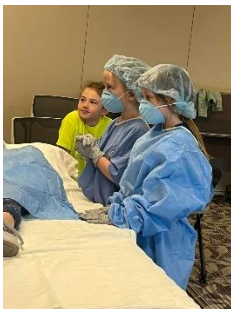
1 st Grade Hospital Trip