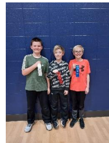
5 th grade Spelling Bee