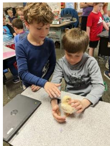
3 rd grade chick hatching