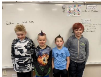
Crazy Hair Lutheran Schools Week