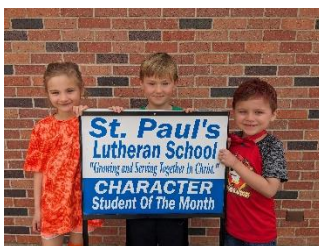
March Character Ed Winners