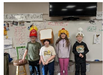
Crazy Hats at Dress Up Day